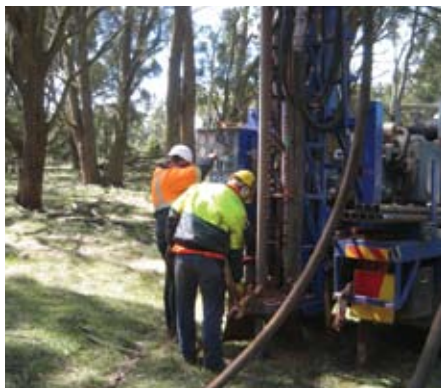
NSW activities are ongoing.

ABZ holds five bauxite tenements in the Goulburn area, which is only 145 km by rail