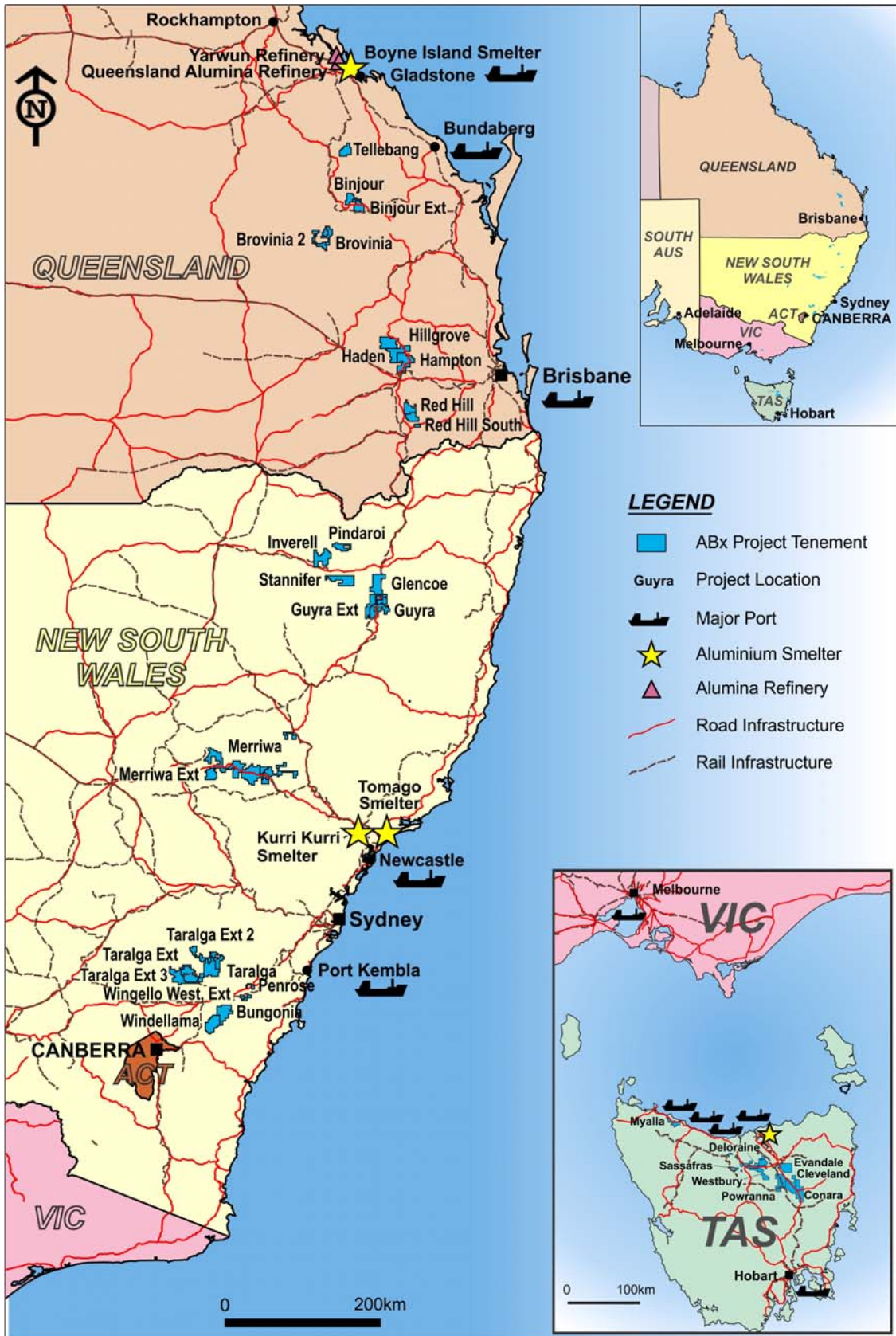
Figure 3: ABx Project Tenements and Major Infrastructure