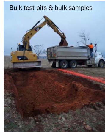
Bulk test pits & bulk samples