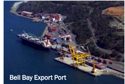
Bell Bay Export Port